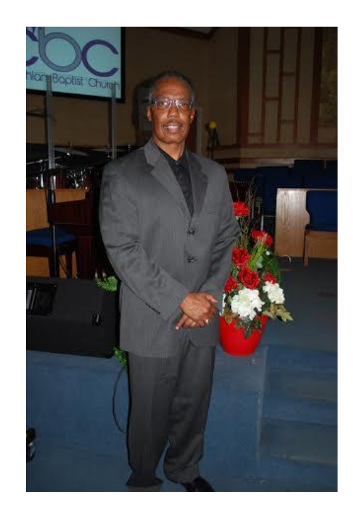
"Ministry Means Service"

Corinthian, all of us are excited about the construction of our new church and family life center. But are we ready to minister to the new community? Are the ministries up to the task?